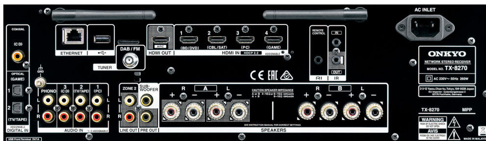
Text on receiver may vary with region.